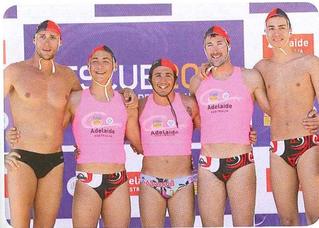
/ Le relais sprint sétois, vainqueur de la finale B