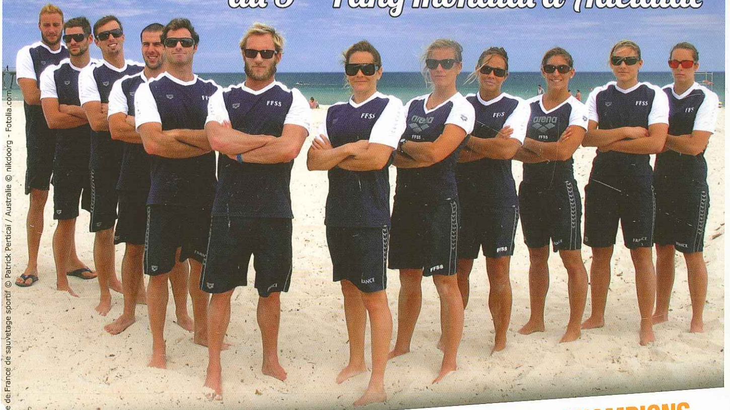
Equipe de France de sauvetage sportif / Australie

Les sauveteurs français au 3 ème rang mondial à Adelaïde